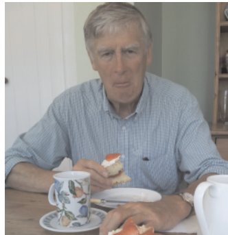
Enjoying a cup of tea and a piece of cake after a long "village walk".