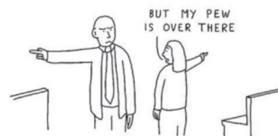
BUT MY PEW IS OVER THERE THE COVER CHURCHWARDEN DIRECTS PEOPLE TO UNEXPECTED SEATS