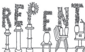
THE TEMPORARY FLOWER ARRANGER CREATES CHALLENGING DISPLAYS