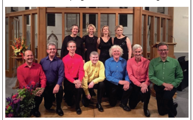
The Close Shaves and The High Heels

The performance will raise funds for the Hampshire branch of the Campaign to Protect Rural England.