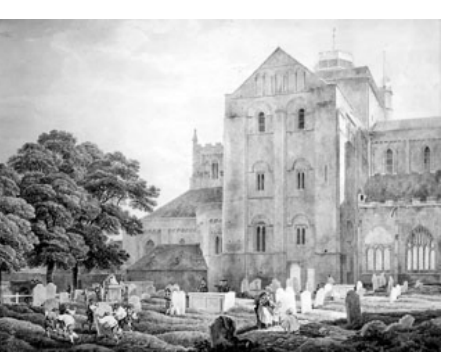
Michael 'Angelo' Rooker's watercolour of Romsey Abbey

but is notoriously unforgiving – artists have to be bold, and there are no second chances. This show features works by British artists from the 18th century to the present day, including many rarely seen gems from Southampton City Art Gallery.