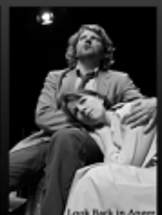
Look Back in Anger