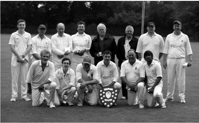
The victorious Holt & Haskell Border League Plate winners

Mottisfont Cricket Club enjoyed a really successful season despite the lack of a sustained summer. It started in late spring with the Indoor League team winning their division, the cup and the Fair Play Award. This was followed up during the summer with the Tuesday evening team winning the Holt & Haskell Border League Cup, easily defeating Ashurst at Romsey Sports Centre. The Saturday team finished a creditable fourth in their division, sealing promotion.