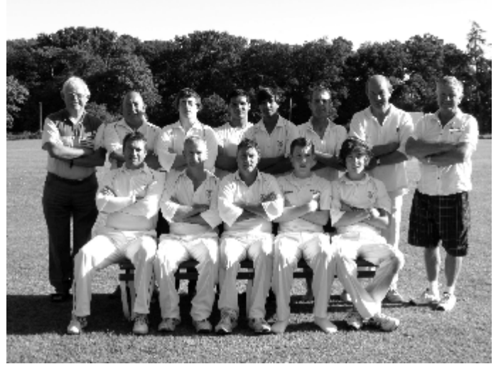
Members of the Mottisfont Cricket Club Team 2011

The Club is always looking for new players, helpers, supporters or benefactors, so feel free to pop along on a Tuesday or a Saturday to support your local team next summer.