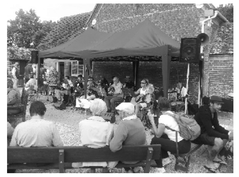
The Birnie Boozle Band enjoying playing to the crowds at the annual Mottisfont Fete

Along with many, I really enjoy the Birnie Boozle Band, and they themselves enjoy playing - they commented on how many